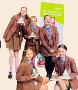
Family Fast Day