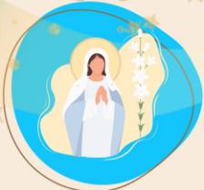
Happy Feast of Immaculate Conception on 8th December

This half term our year 11 students completed their first assessment in the hall covering four topics that they will be examined on in the summer. Our students showed great resilience and hard work both in the lead up to and during their assessment.